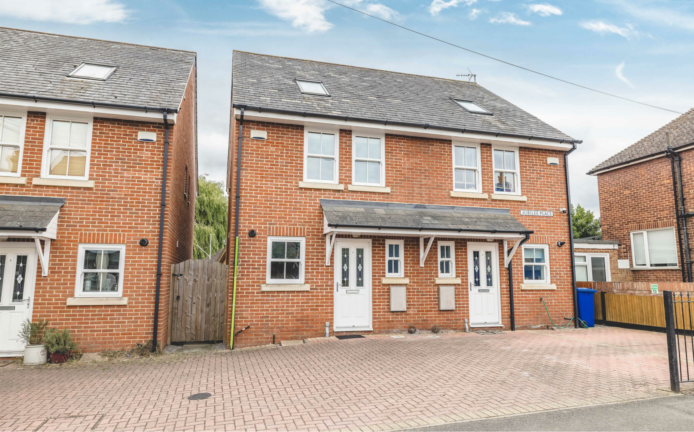
3 Jubilee Place St. Leonards Road, Windsor, SL4 3FG £500,000